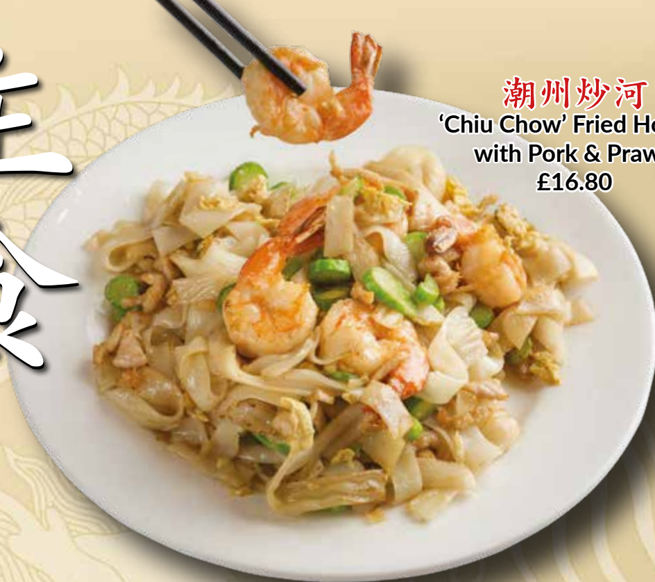
潮州炒河 'Chiu Chow' Fried Ho Fun with Pork & Prawn £16.80