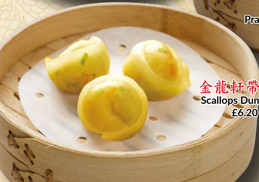
金龍軒帶子餃 Scallops Dumplings £6.20