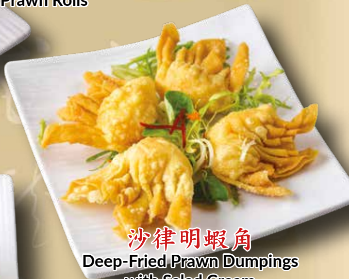
沙律明蝦角 Deep-Fried Prawn Dumpings with Salad Cream £6.20