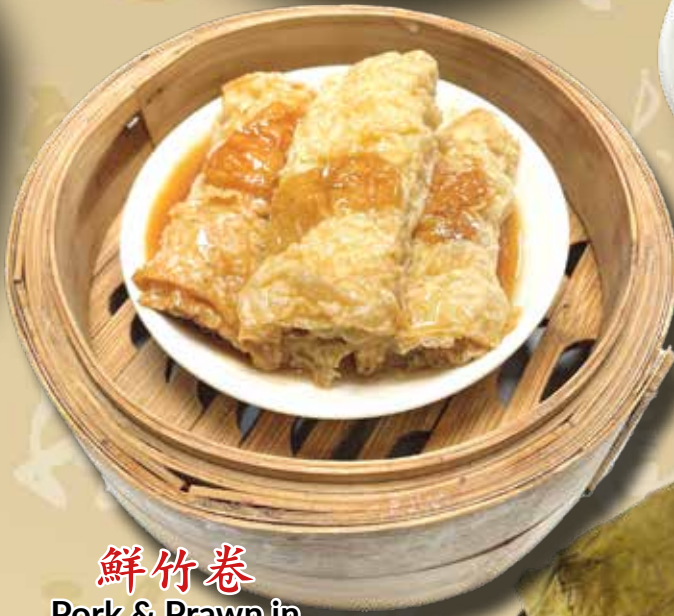
鮮竹卷 Pork & Prawn in Bean Curd Rolls £6.20