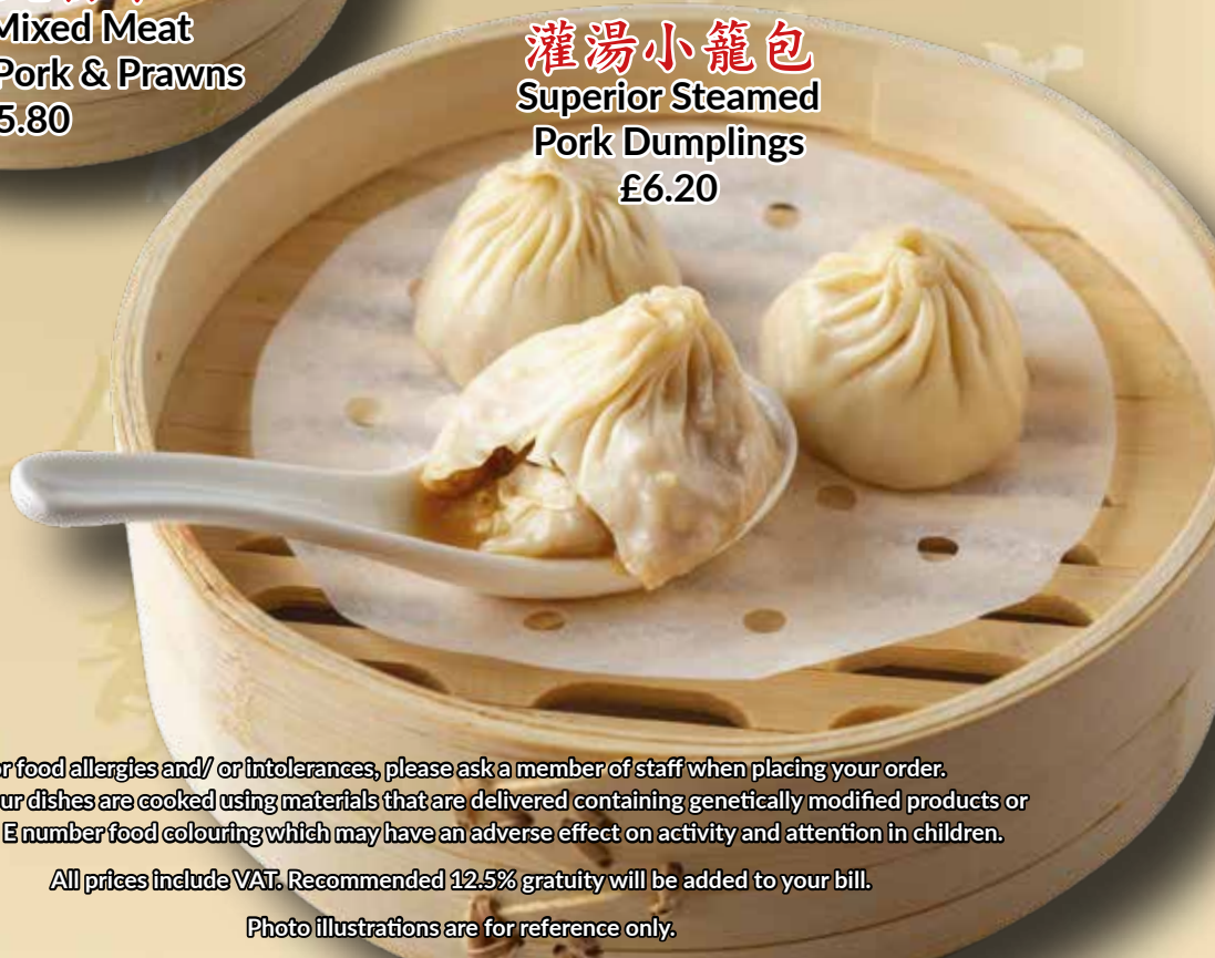
灌湯小籠包 Superior Steamed Pork Dumplings £6.20

For food allergies and/ or intolerances, please ask a member of staff when placing your order. Some of our dishes are cooked using materials that are delivered containing genetically modified products or contain E number food colouring which may have an adverse effect on activity and attention in children.