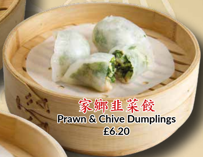
家鄉韭菜餃 Prawn & Chive Dumplings £6.20