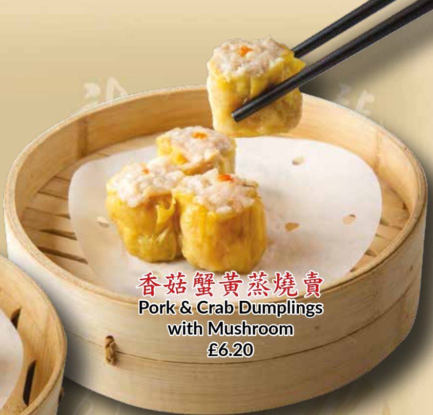
香菇蟹黃蒸燒賣 Pork & Crab Dumplings with Mushroom £6.20