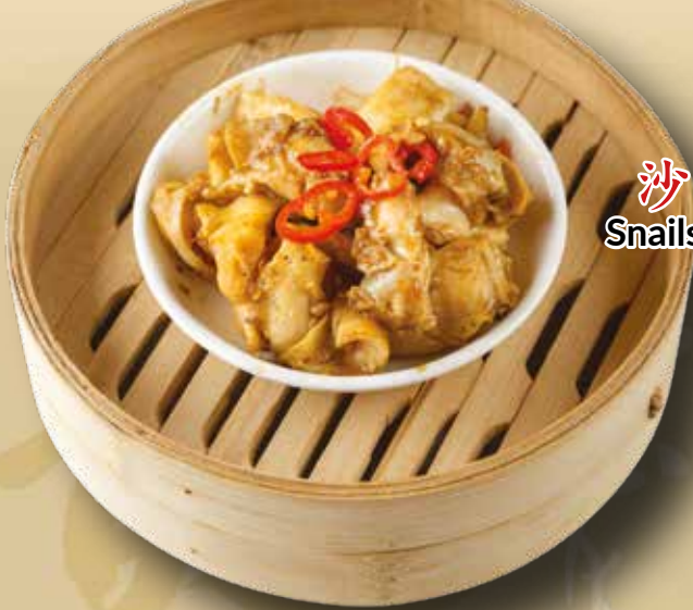
沙爹東風螺 Snails in Satay Sauce £6.20