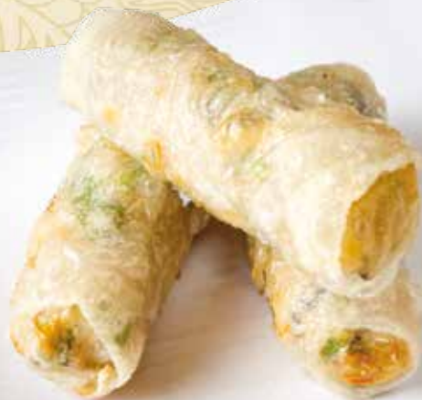
越式炸春卷 Vietnamese Crispy Spring Rolls with Pork & Prawns £6.20