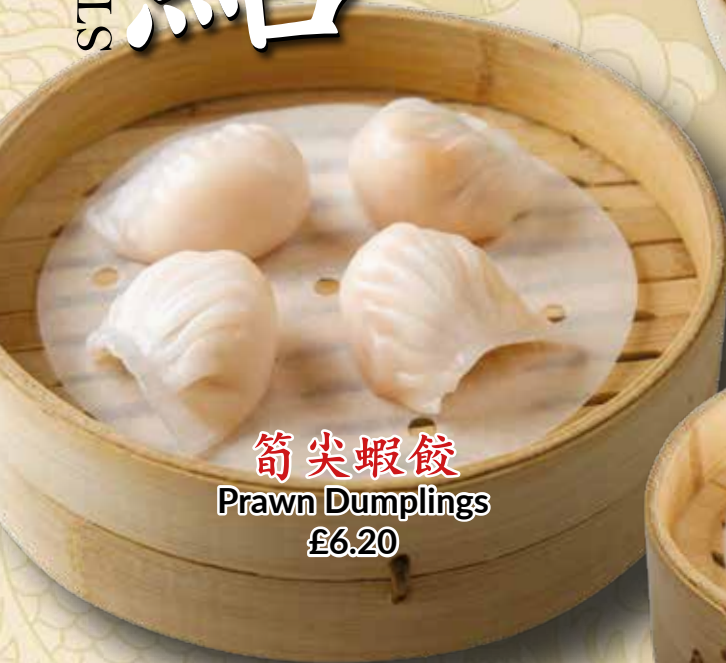
筍尖蝦餃 Prawn Dumplings £6.20