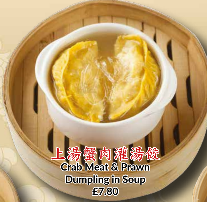
上湯蟹肉灌湯餃 Crab Meat & Prawn Dumpling in Soup £7.80