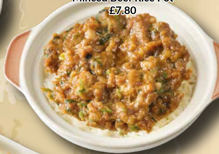
免治牛肉飯 Minced Beef Rice Pot £7.80