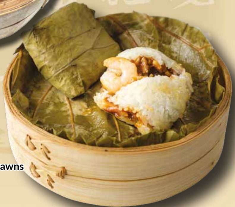
迷你珍珠雞 Mini Glutinous Rice in Lotus Leaves with Pork & Prawns £7.20