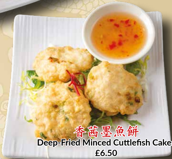
香茜墨魚餅 Deep-Fried Minced Cuttlefish Cakes £6.50