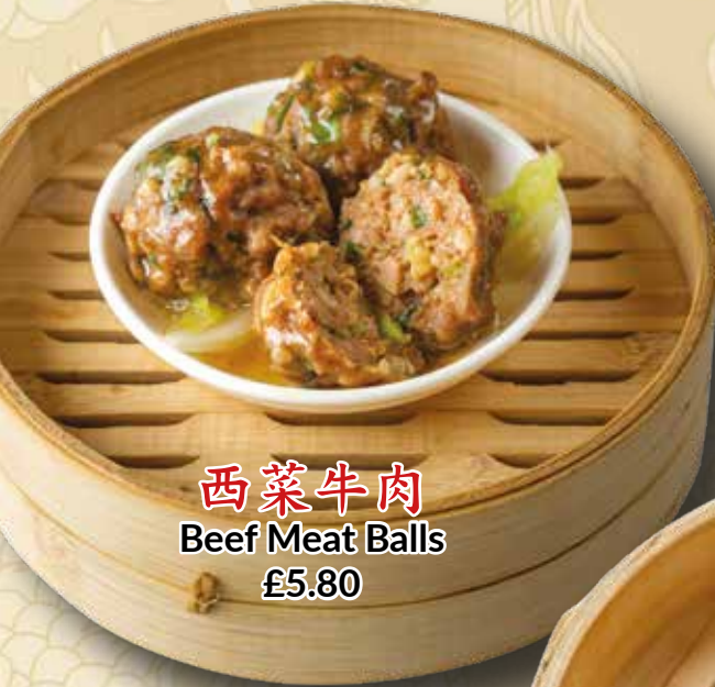
西菜牛肉 Beef Meat Balls £5.80