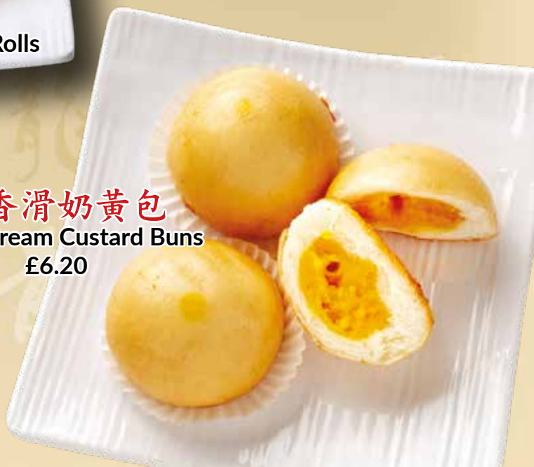
炸香滑奶黃包 Crispy Cream Custard Buns £6.20