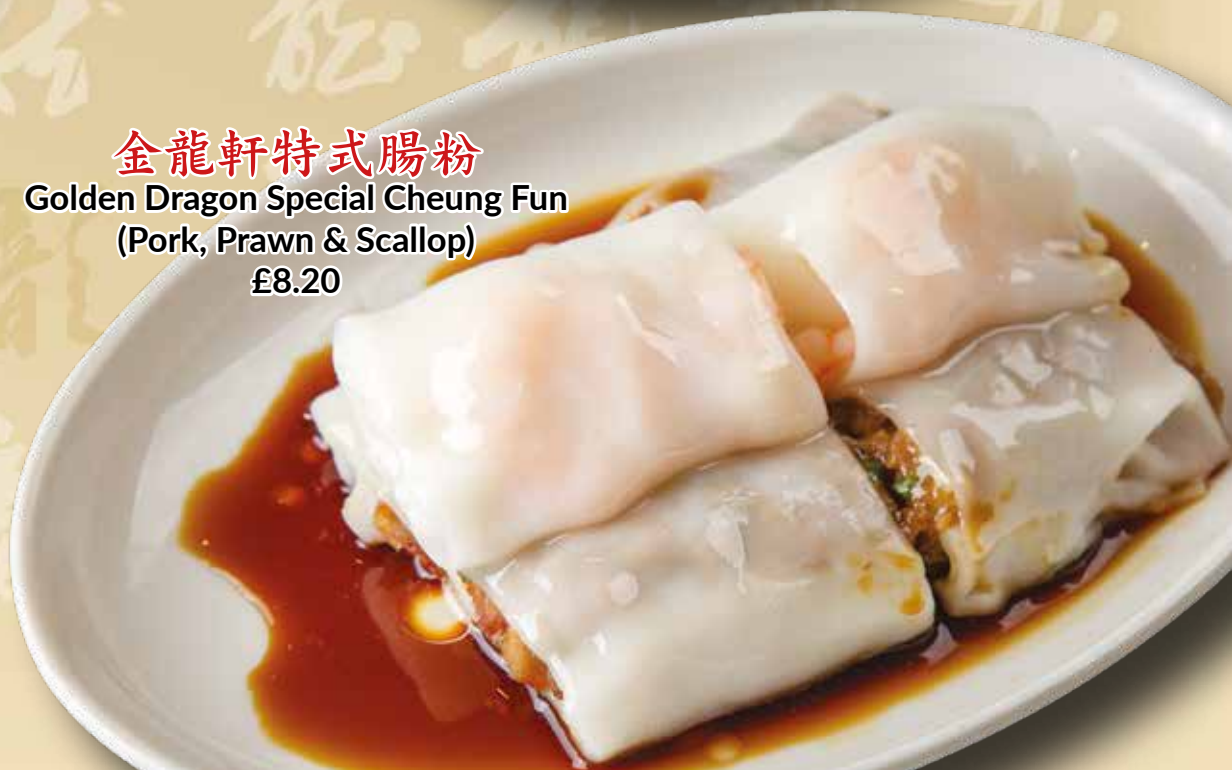
金龍軒特式腸粉 Golden Dragon Special Cheung Fun (Pork, Prawn & Scallop) £8.20