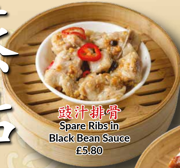
豉汁排骨 Spare Ribs in Black Bean Sauce £5.80