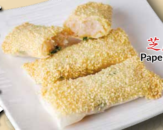
芝麻紙包蝦 Paper Wrap Prawns £6.20