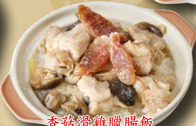
香菇滑雞臘腸飯 Chinese Mushroom, Chicken & Cured Sausage Rice Pot £7.80