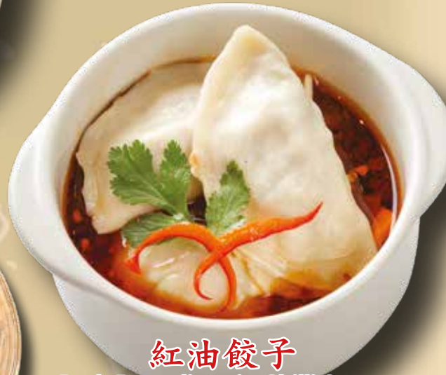
紅油餃子 Pork Dumplings in Chilli Sauce £6.20