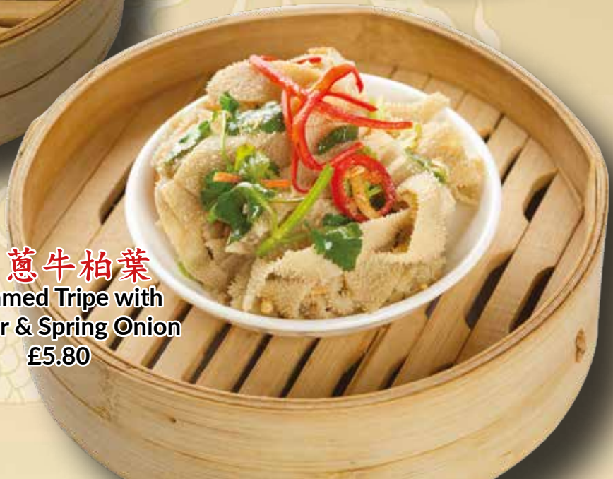
薑蔥牛柏葉 Steamed Tripe with Ginger & Spring Onion £5.80