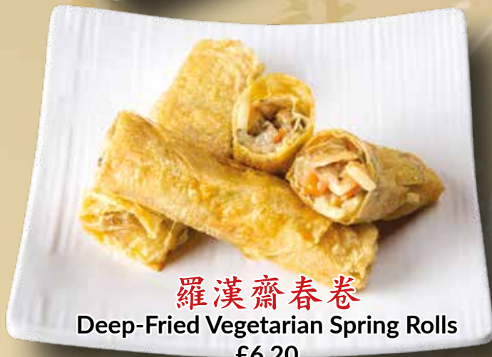
羅漢齋春卷 Deep-Fried Vegetarian Spring Rolls £6.20