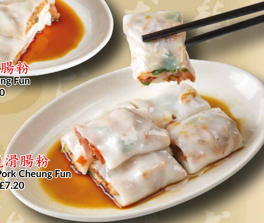
叉燒滑腸粉 'Char Siu' Pork Cheung Fun £7.20