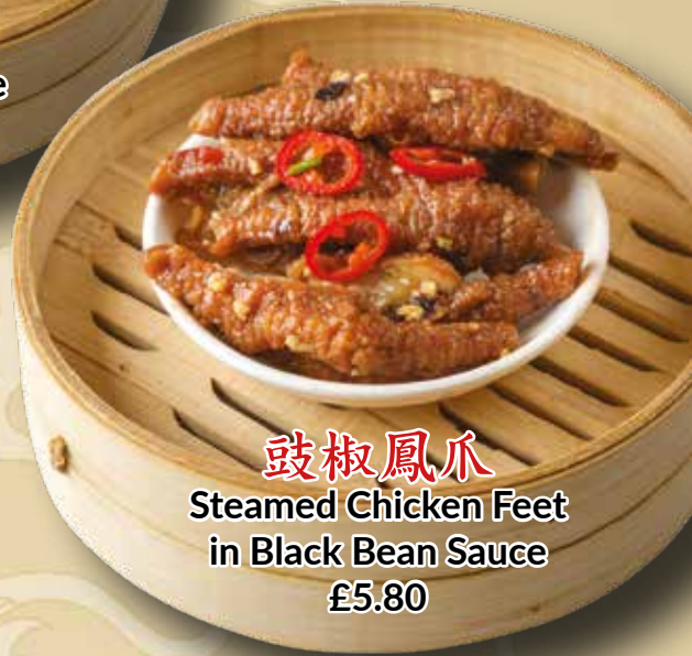
豉椒鳳爪 Steamed Chicken Feet in Black Bean Sauce £5.80