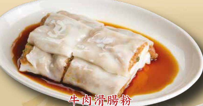
牛肉滑腸粉 Beef Cheung Fun £7.20