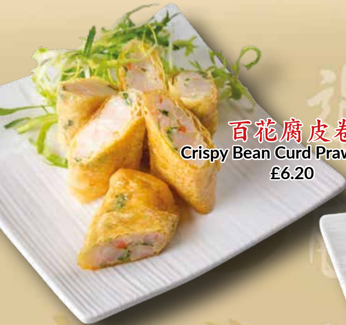
百花腐皮卷 Crispy Bean Curd Prawn Rolls £6.20