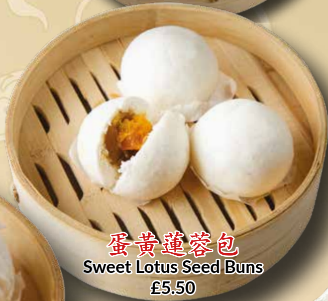
蛋黃蓮蓉包 Sweet Lotus Seed Buns £5.50