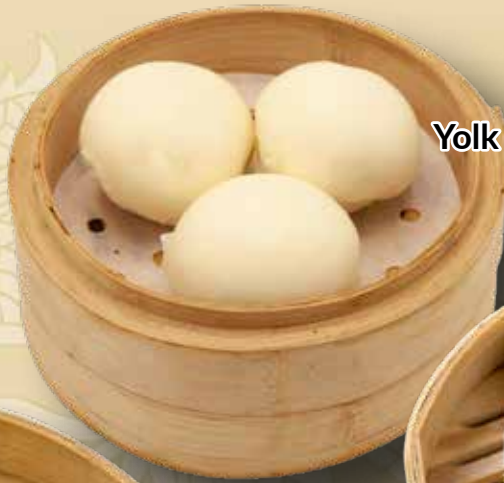
流沙包 Yolk Lava Custard Buns £6.80