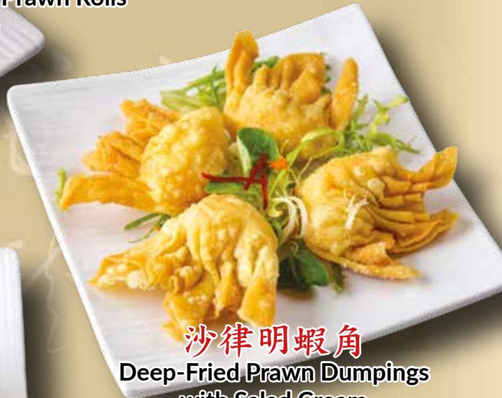
沙律明蝦角 Deep-Fried Prawn Dumplings with Salad Cream £5.80