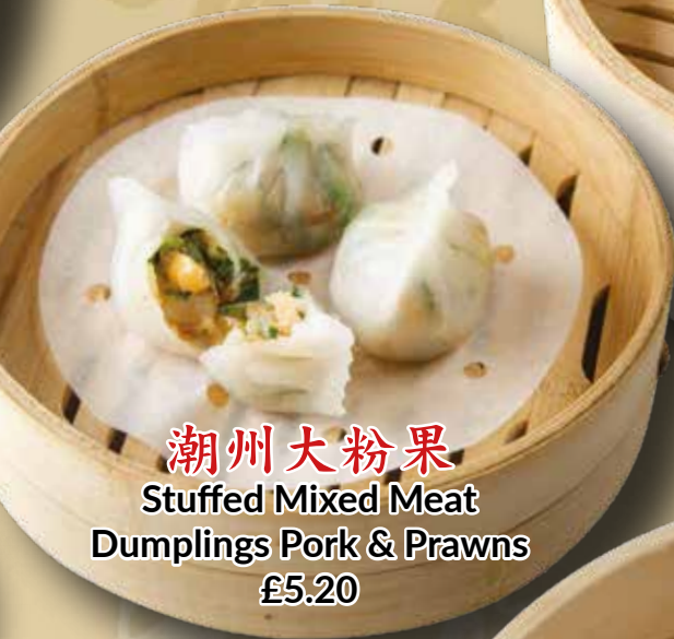
潮州大粉果 Stuffed Mixed Meat Dumplings Pork & Prawns £5.20