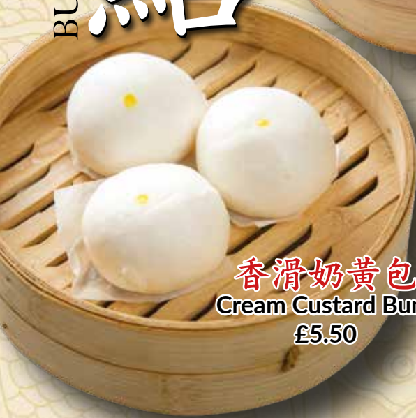
香滑奶黃包 Cream Custard Buns £5.50