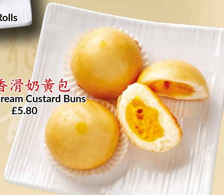
炸香滑奶黃包 Crispy Cream Custard Buns £5.80