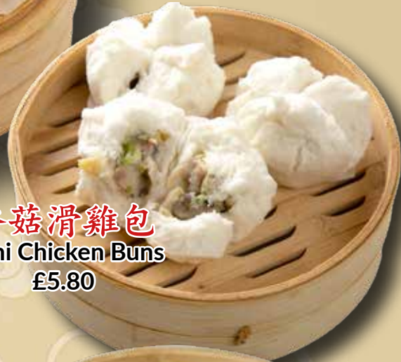
香菇滑雞包 Mini Chicken Buns £5.80