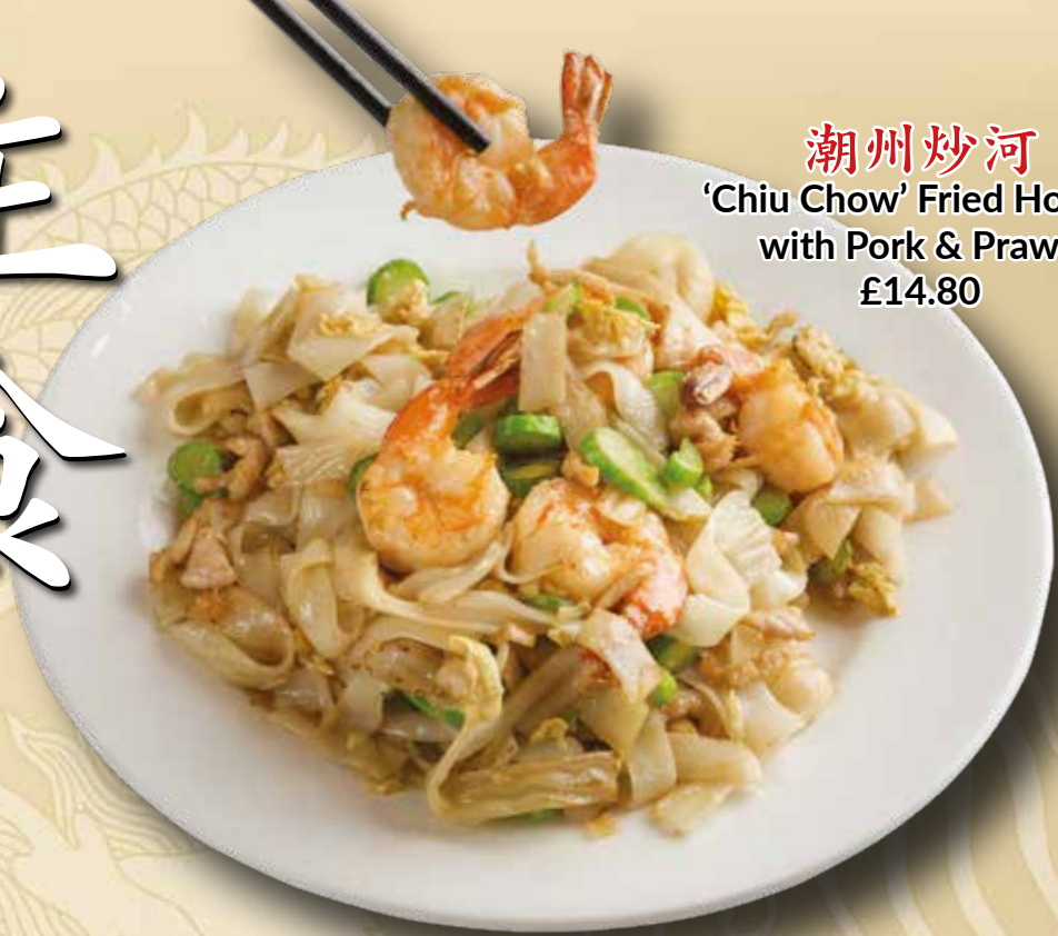
潮州炒河 'Chiu Chow' Fried Ho Fun with Pork & Prawn £14.80