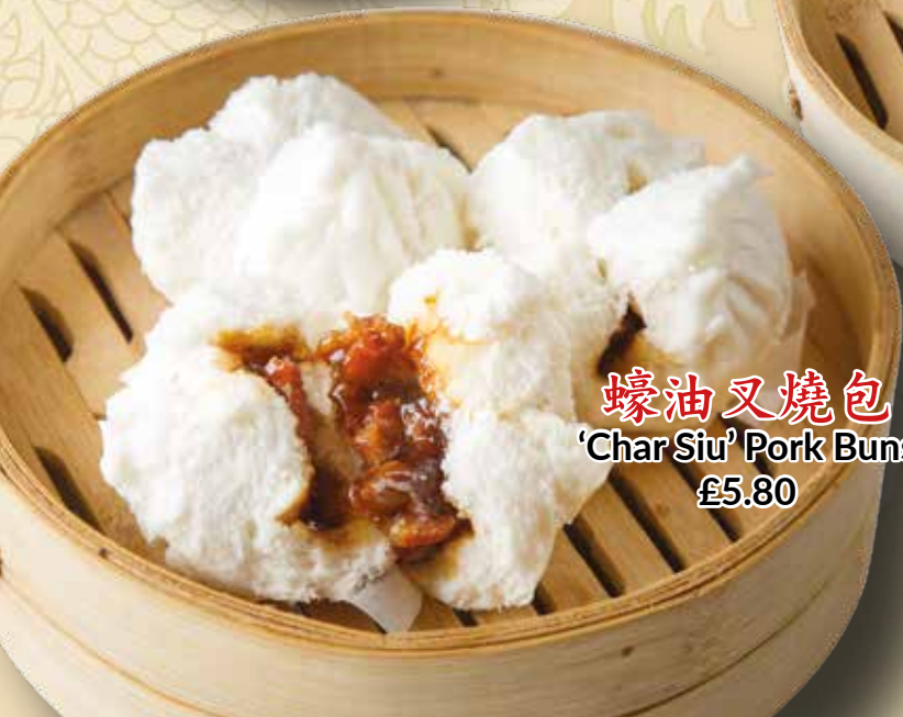
蠔油叉燒包 'Char Siu' Pork Buns £5.80