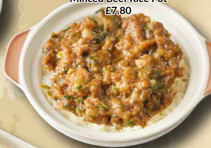
免治牛肉飯 Minced Beef Rice Pot £7.80