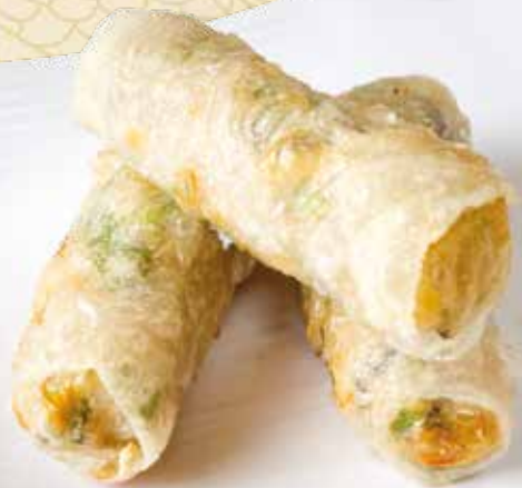
越式炸春卷 Vietnamese Crispy Spring Rolls with Pork & Prawns £5.80