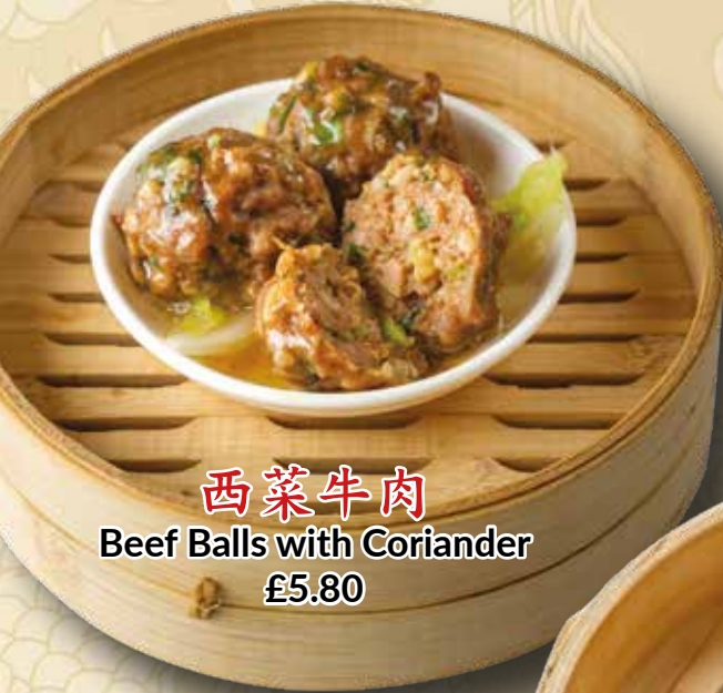
西菜牛肉 Beef Balls with Coriander £5.80