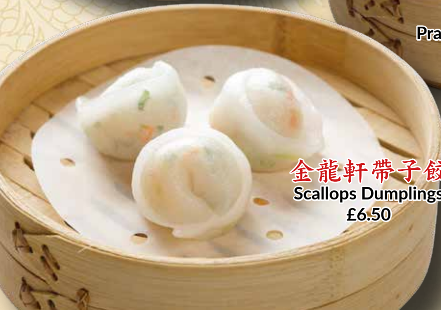
金龍軒帶子餃 Scallops Dumplings £6.50