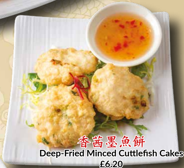
香茜墨魚餅 Deep-Fried Minced Cuttlefish Cakes £6.20